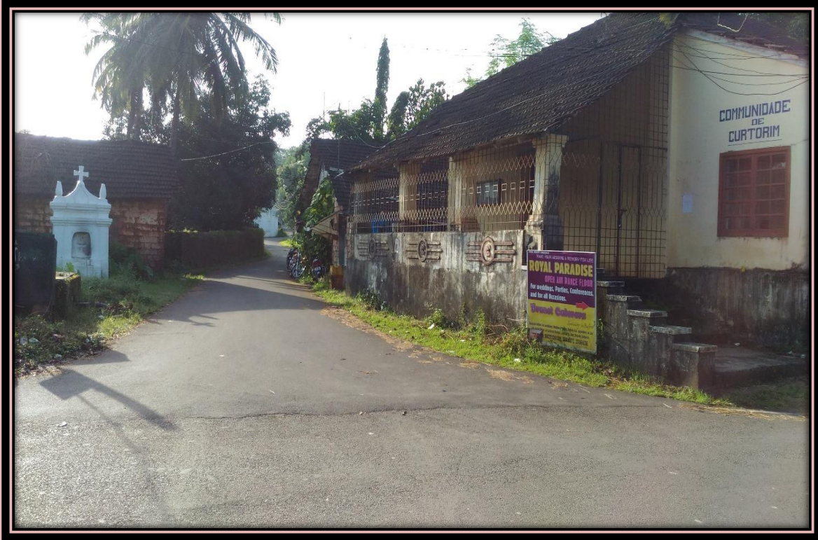
COMMUNIDADE OF CURTORIM