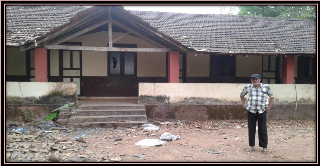
GOVERNMENT PRIMARY SCHOOL VIRABHAT