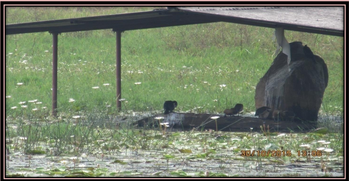
HERITAGE SITE IN RALLOI TOLLEM