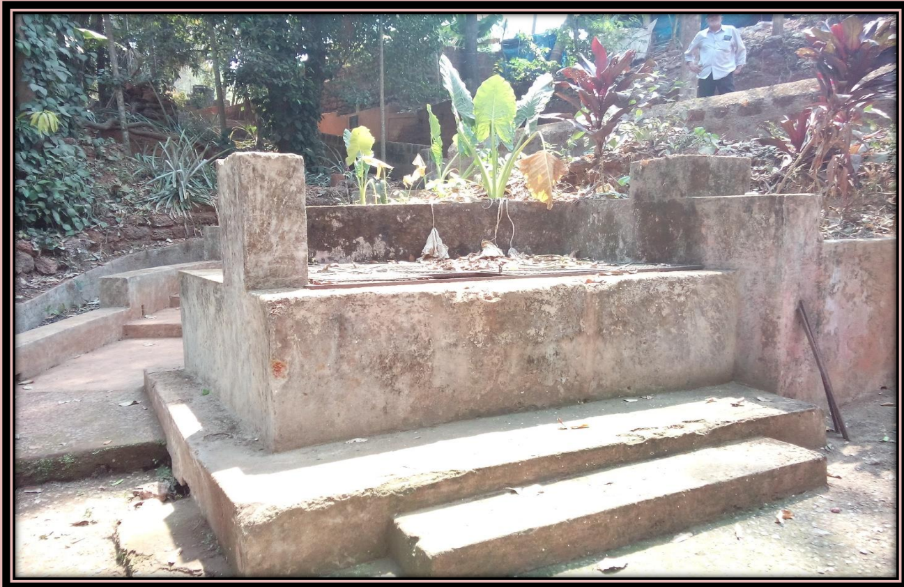
SPRING AT TAMBETIM