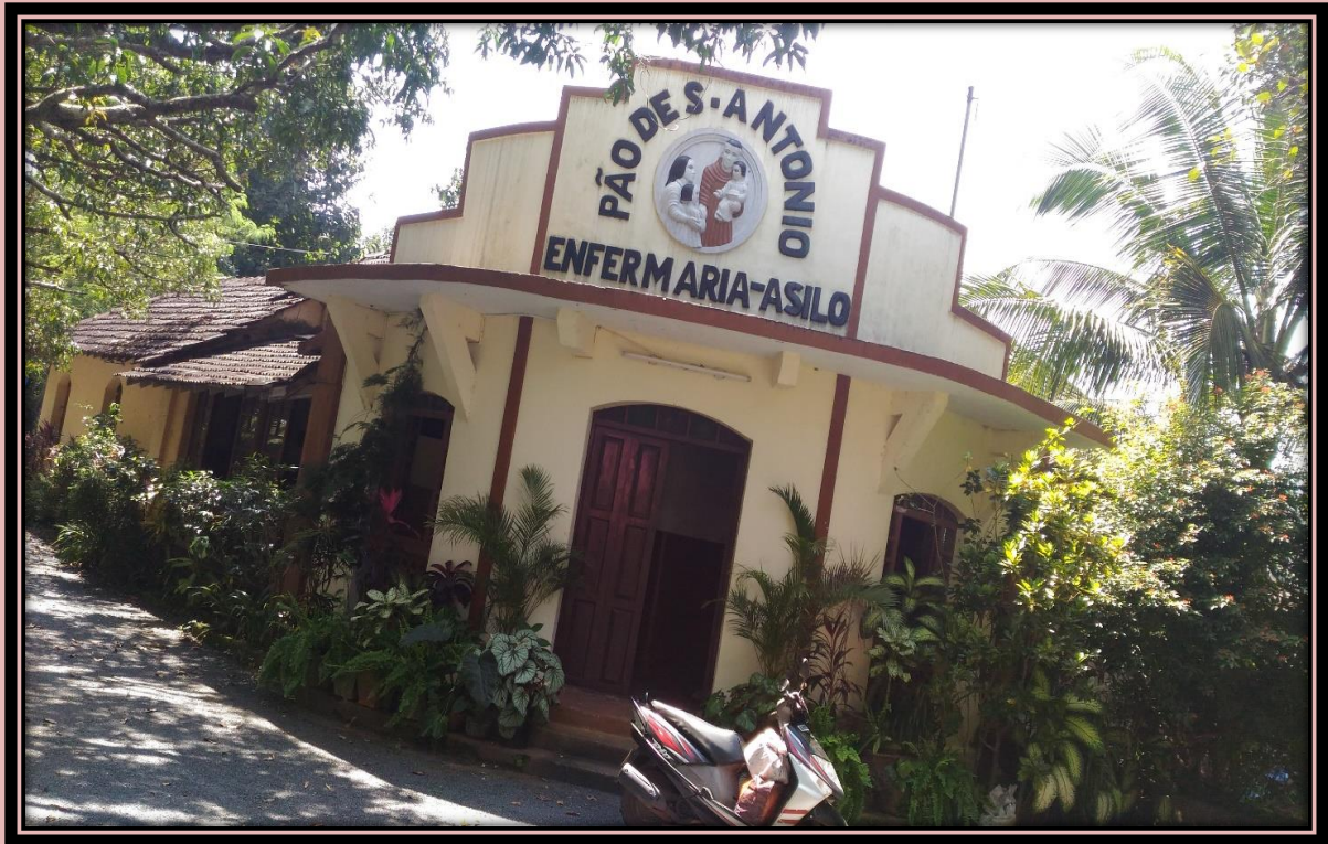
OLD AGE HOME