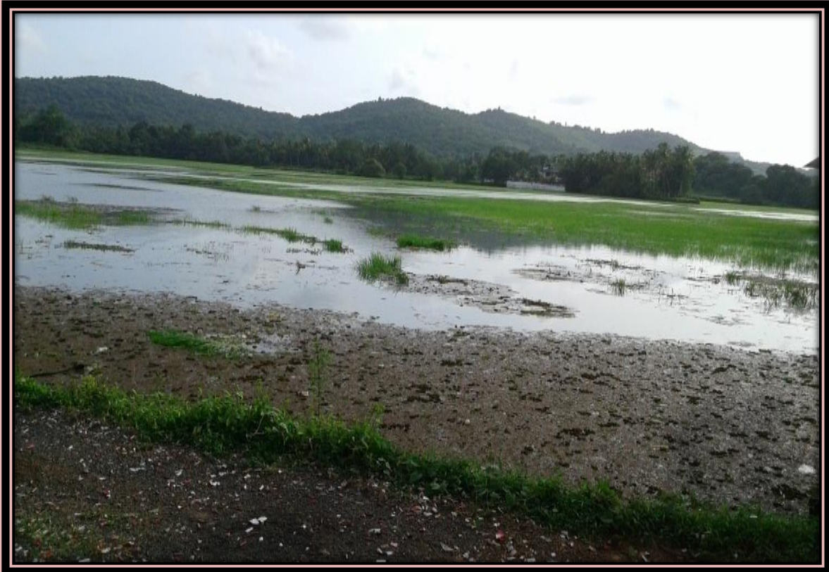
ANGDI TOLLEM CURTORIM