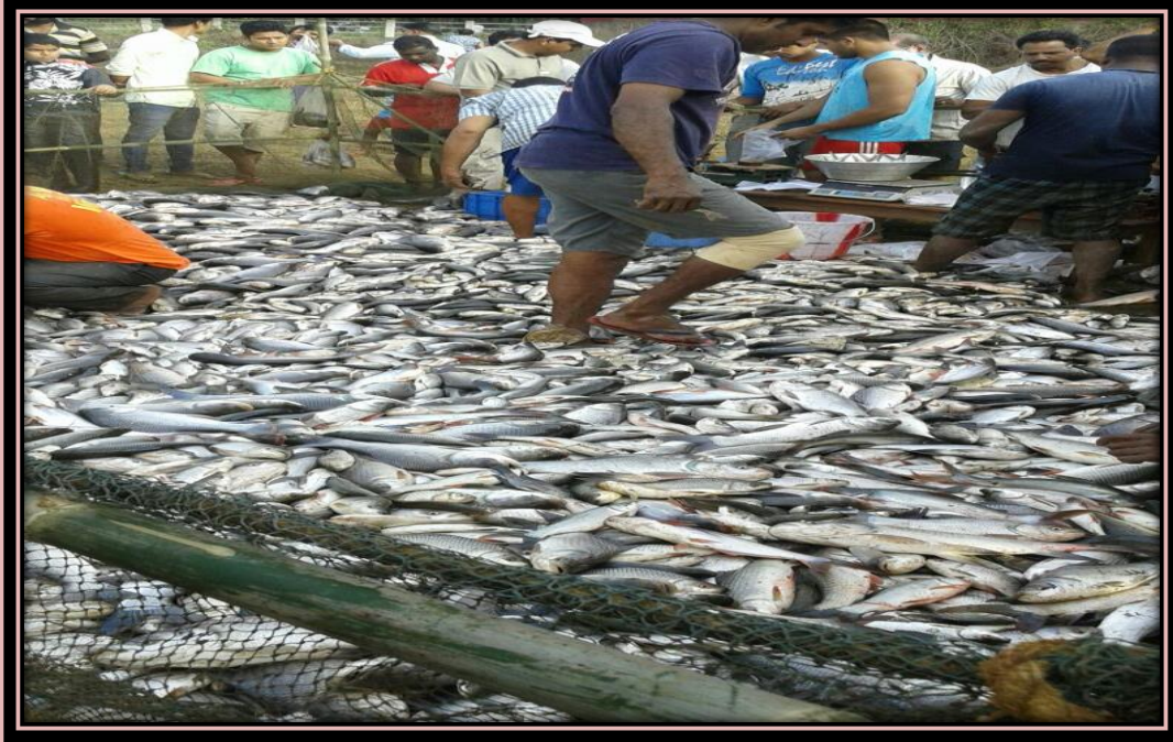
FISHING ACTIVITY AT MAITOLLEM LAKE