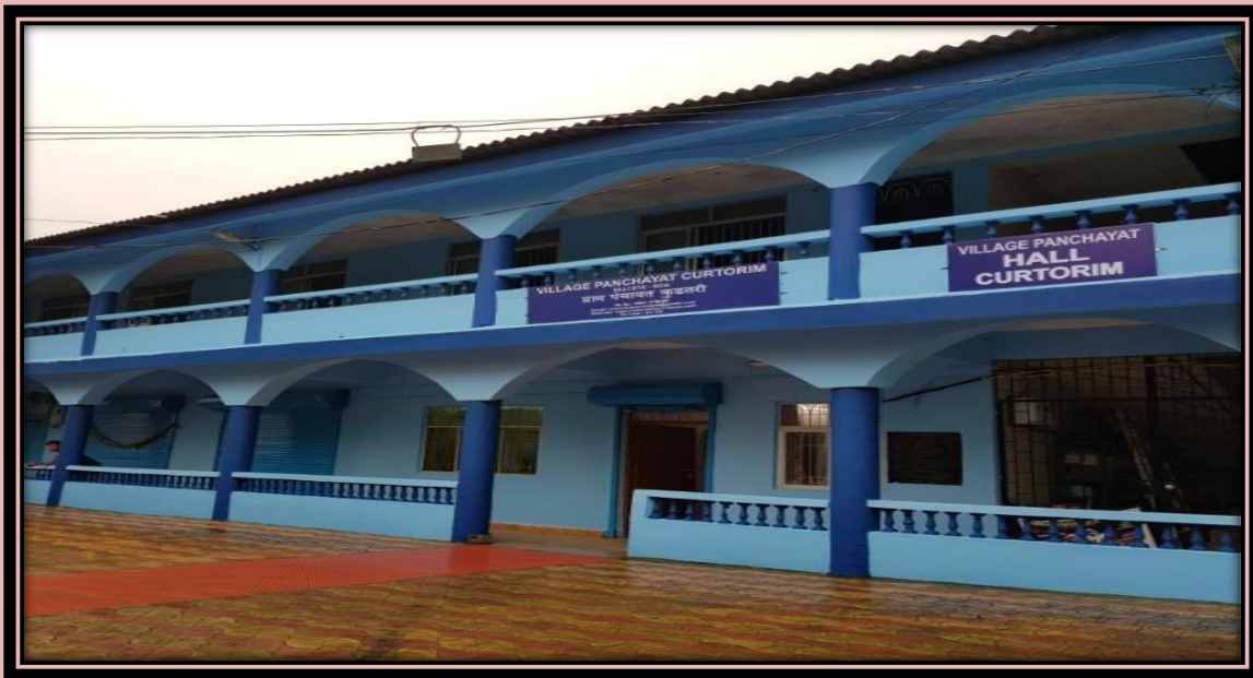
Village Panchayat Curtorim