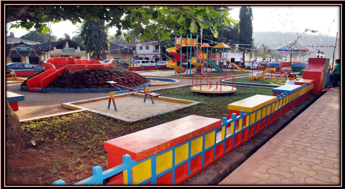
ST. ALEX CHURCH GARDEN