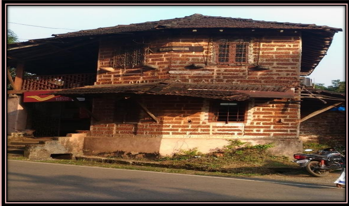
POST OFFICE CURTORIM