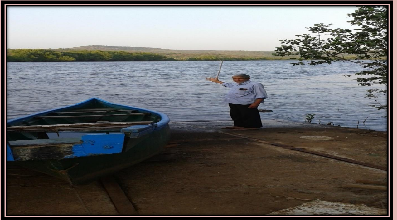
RAMP AT ULLANDO