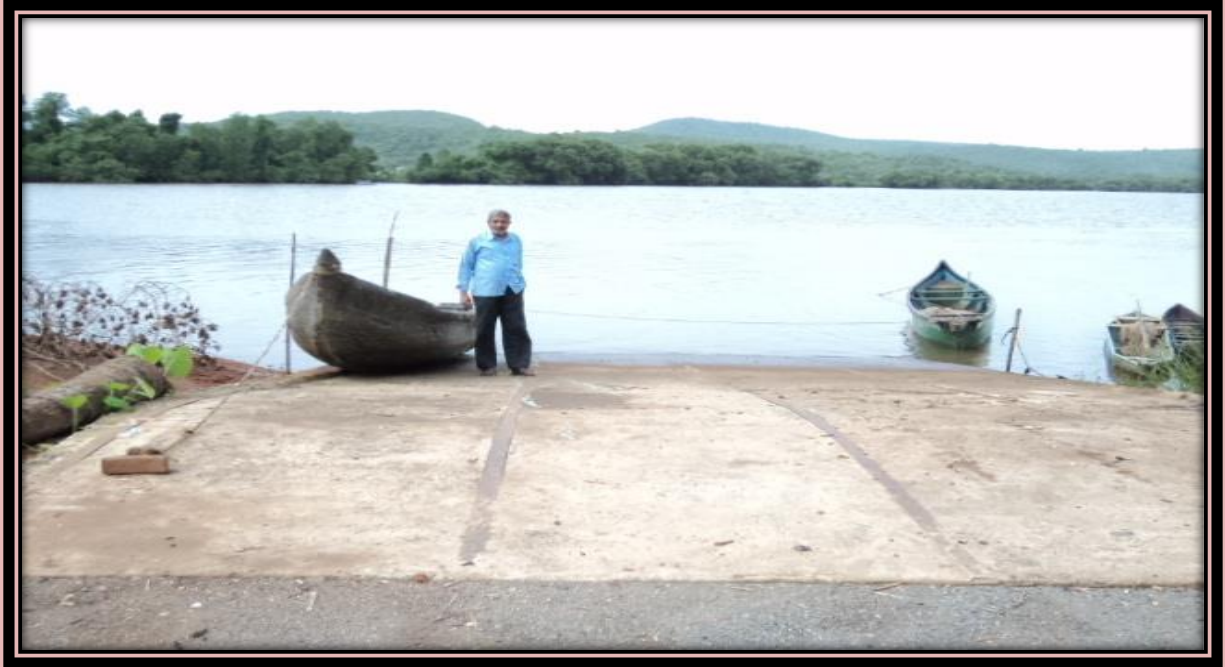
RAMP AT ULLANDO