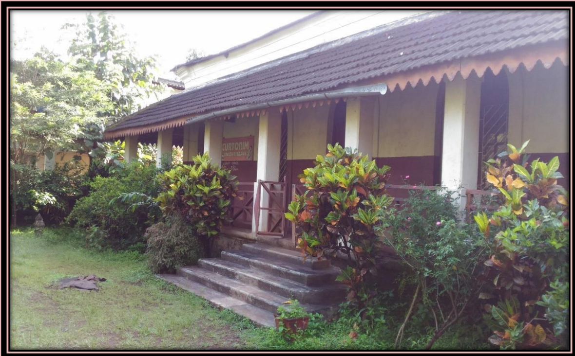
CURTORIM UNION LIBRARY