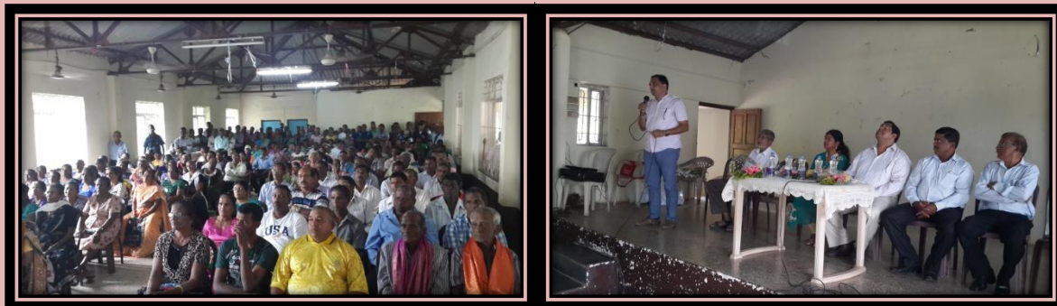
Focused group discussion with Farmers