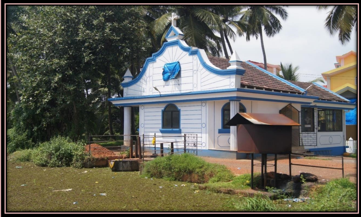
HANDI CROSS AT MAINA AND SLUICE-GATE