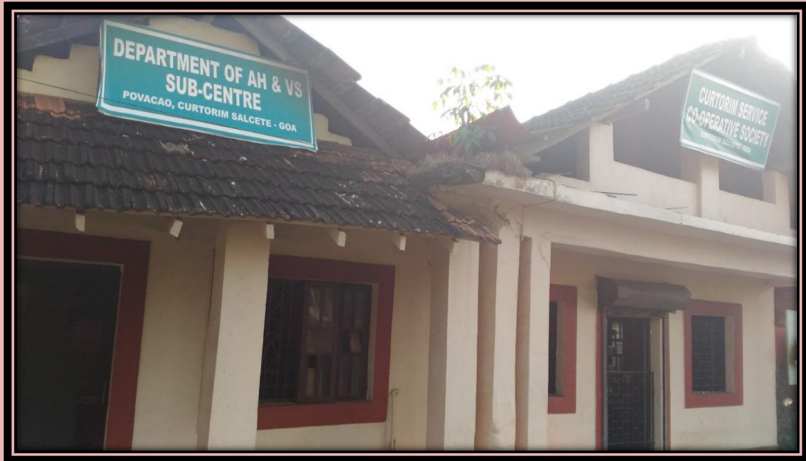
DEPARTMENT OF AH & VS SUB-CENTRE / CURTORIM SERVICE CO-OPERATIVE SOCIETY