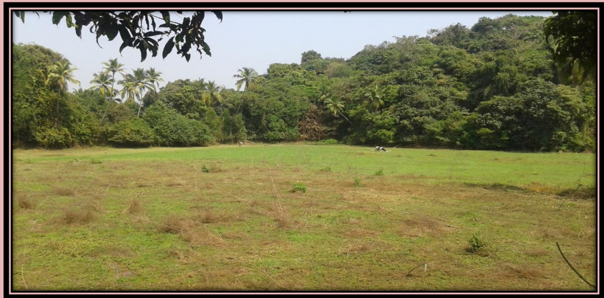
GUD TOLLEM AGXEM