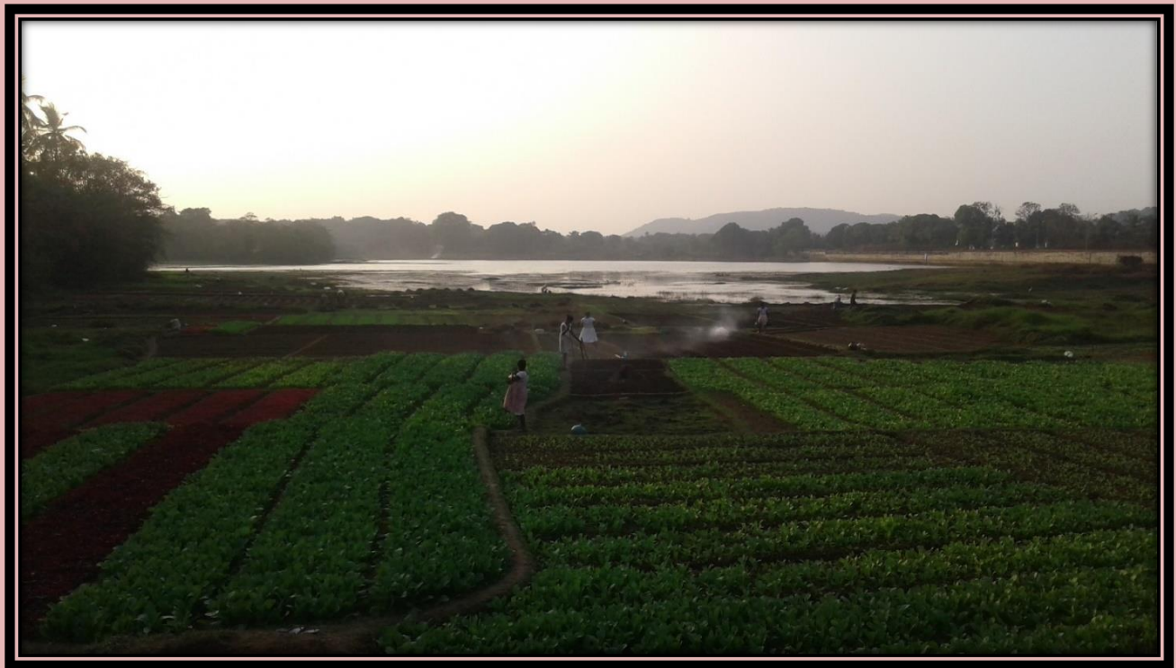
VEGETABLE PLANTATION IN CURTORIM