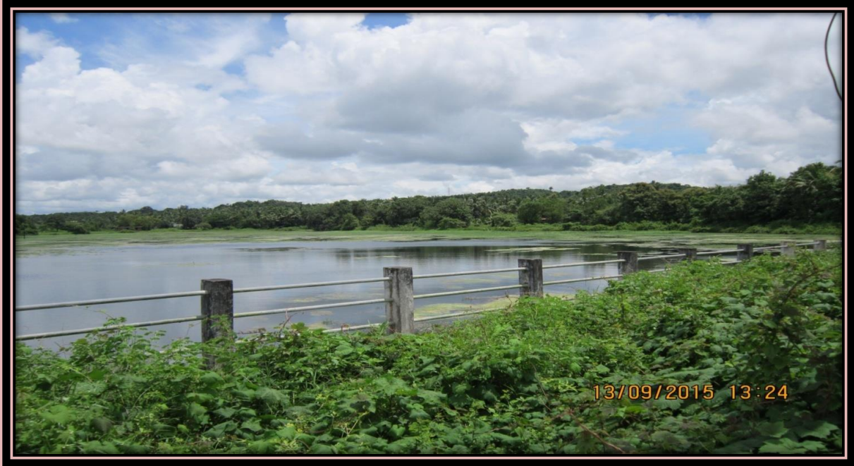
MAI TOLLEM CORJEM